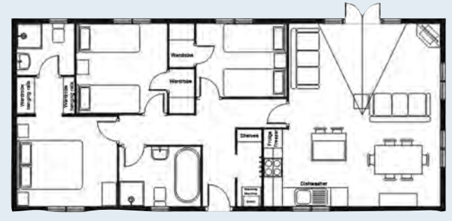
End living layout - 45' \times 20' (13.8 \times 6.1m)