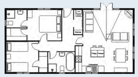
End living layout - 40^{\circ} \times 20^{\circ} (12.3 × 6.1m)