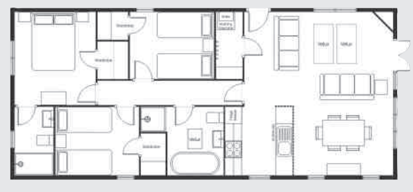
45' x 20' (13.8 x 6.1m)

Alternative sizes, including I bedroom, 4 bedroom and 22' wide models are available on request.