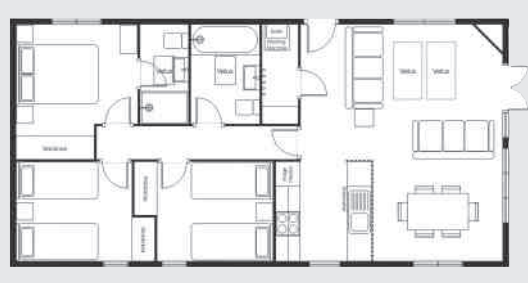
40' x 20' (12.3 x 6.1m)