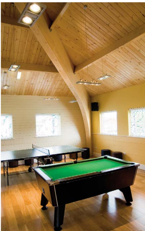
The games room