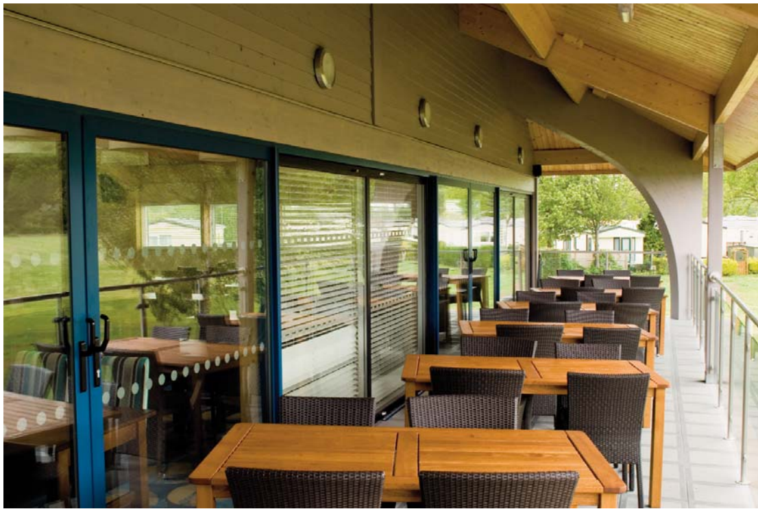
The covered balcony