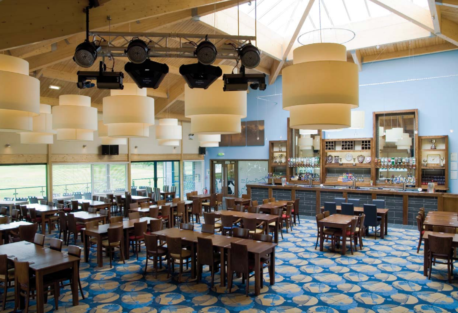
The function room