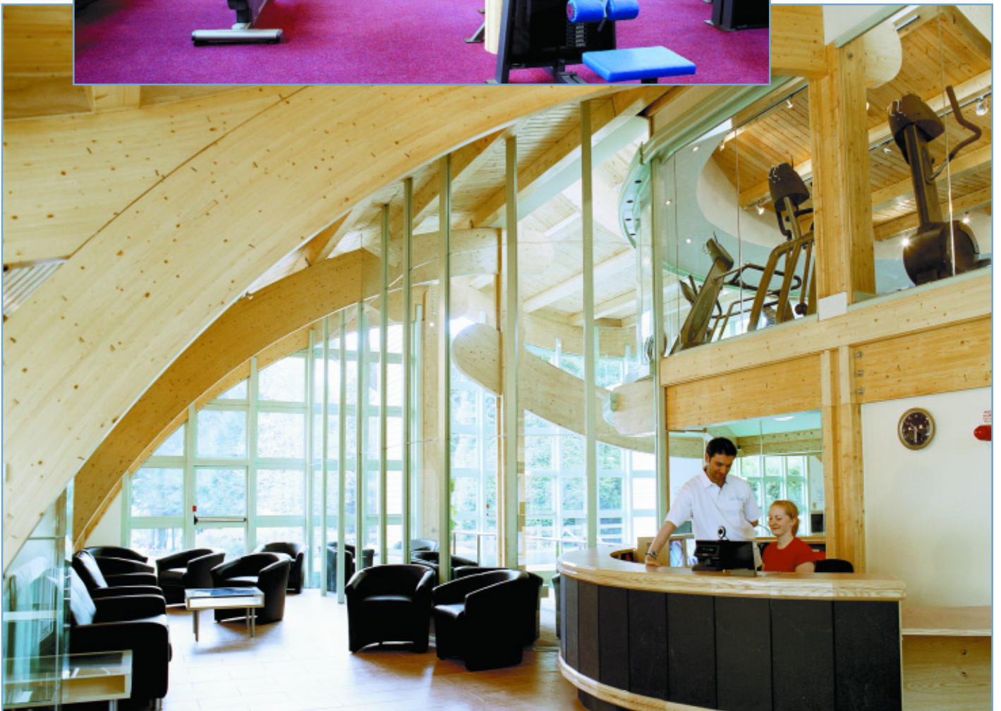
Reception and relaxation area.