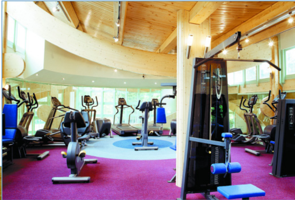
Gymnasium with a wide range of the latest fitness equipment.