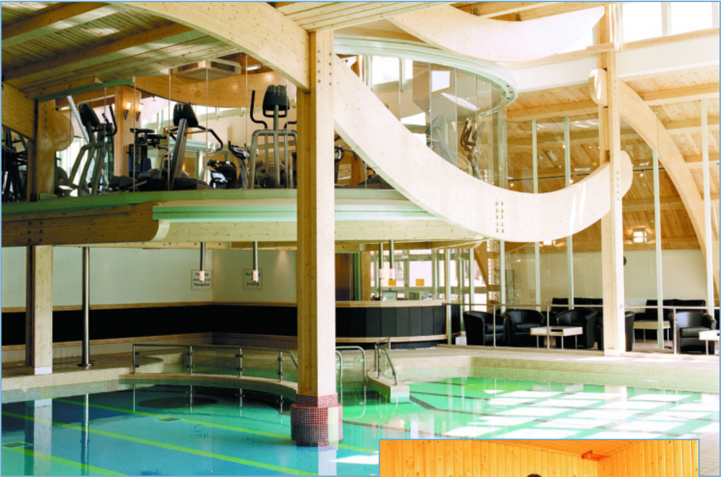
The gymnasium dramatically suspended above the swimming pool.