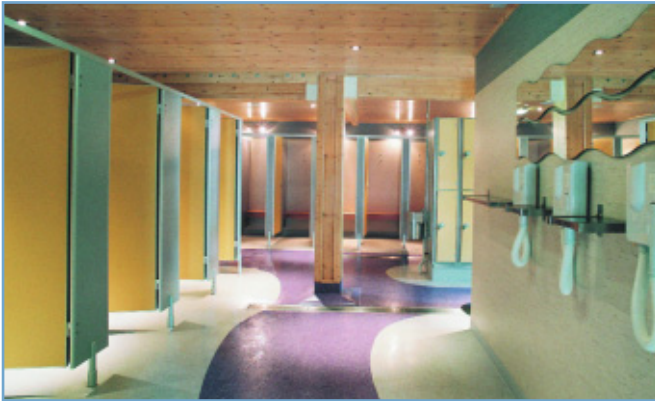
Changing room and showers.

The strong, permanent framework provided by the columns and curved roof maximise the internal space and also carry the load of a mezzanine fitness suite.