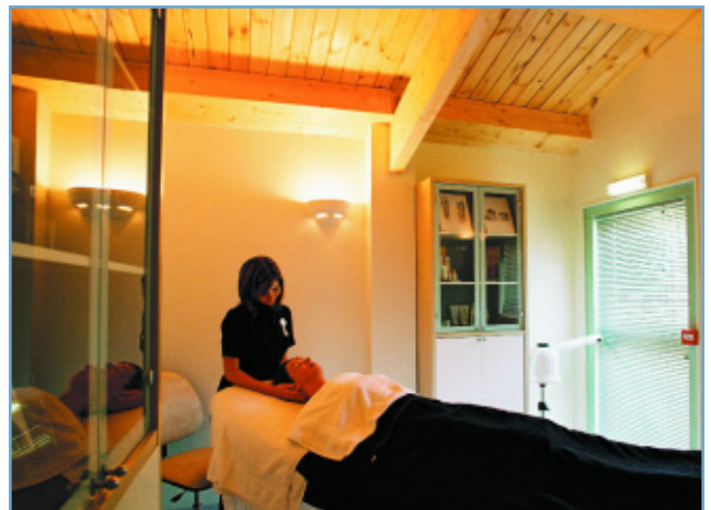
Beauty treatment and therapy area.