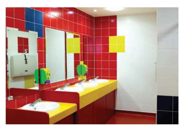
Child friendly toilets