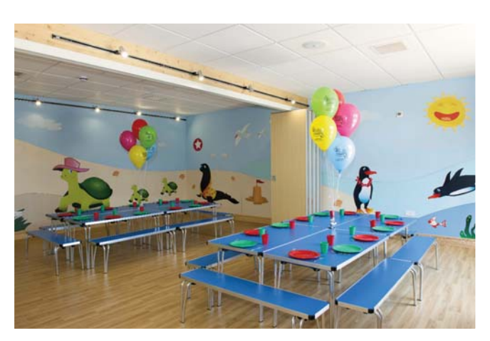
The two party rooms with acoustic wall folded back