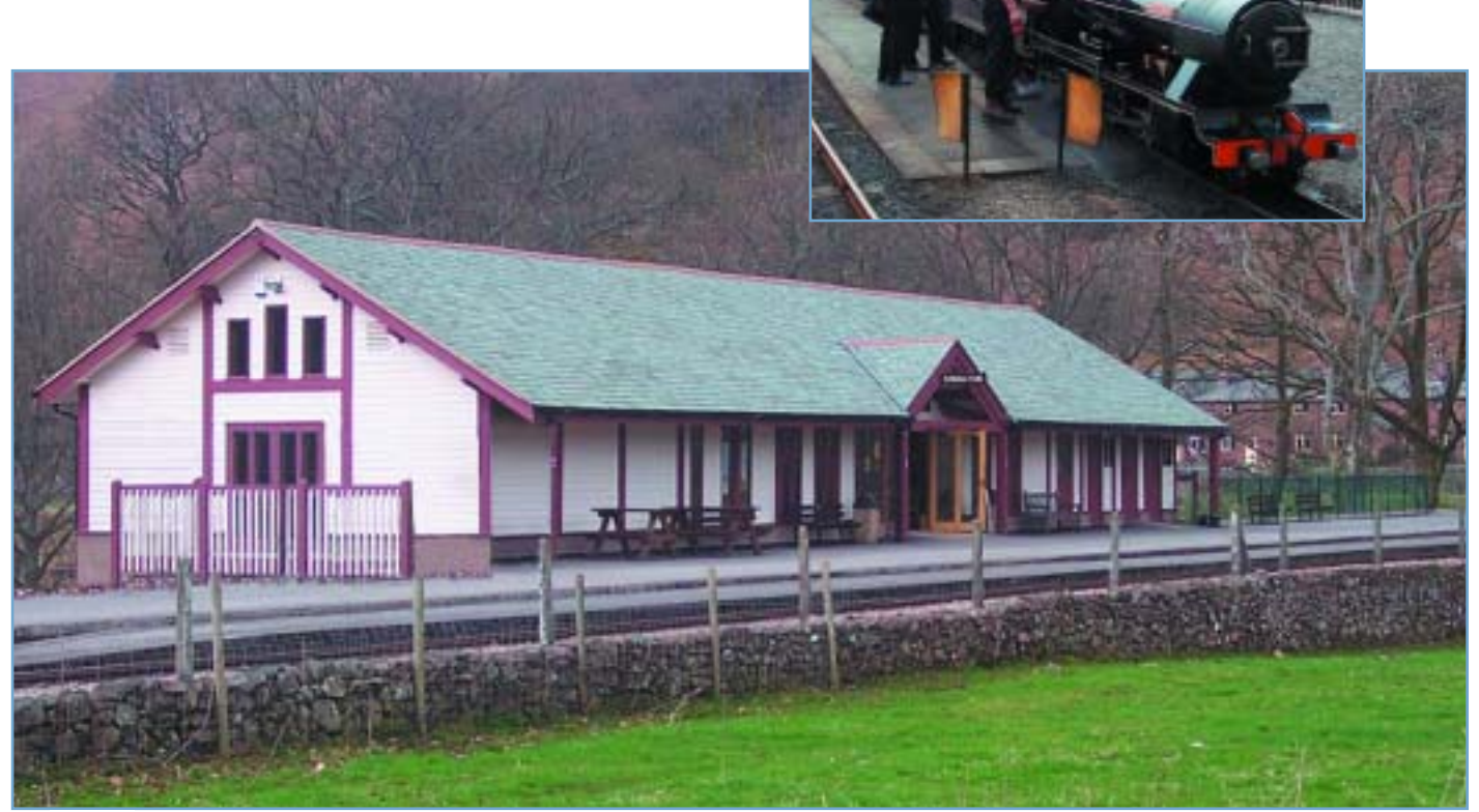
Dalegarth Station and visitor centre.

Visitors have level access from the platform to the ticket office, 'Fellbites' cafe and the Scafell gift shop. A generous staircase leads down to the open plan lower floor which accommodates the other functions of the building.