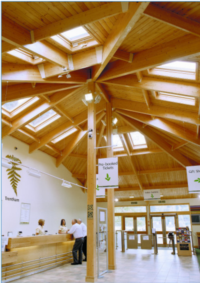
The open vaulted roof of the visitors centre.