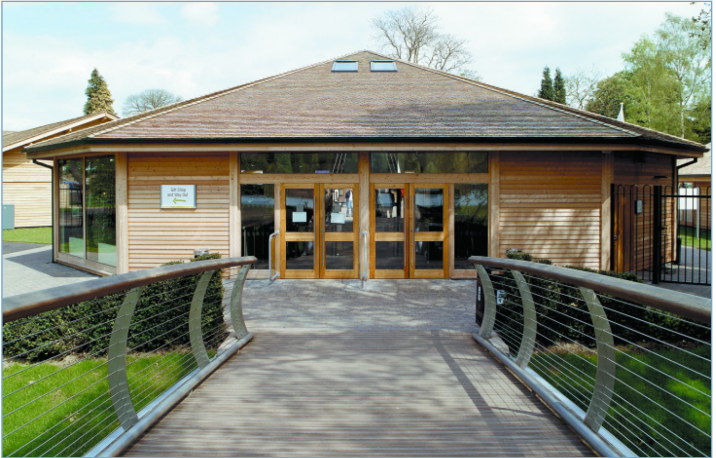
Visitor centre viewed from the bridge into the Gardens.

Manufactured from the same materials, the retail units are of a more conventional 'chalet' type design incorporating large windows and glazed doors to the elevation facing the street. The internal walls were lined with plasterboard ready to accept the shop fittings selected by each retailer.