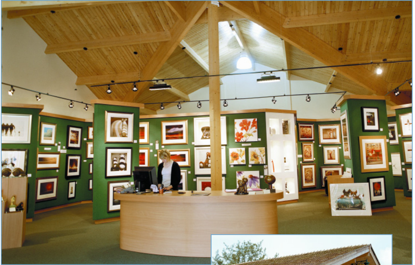
An example of one of the retail units.