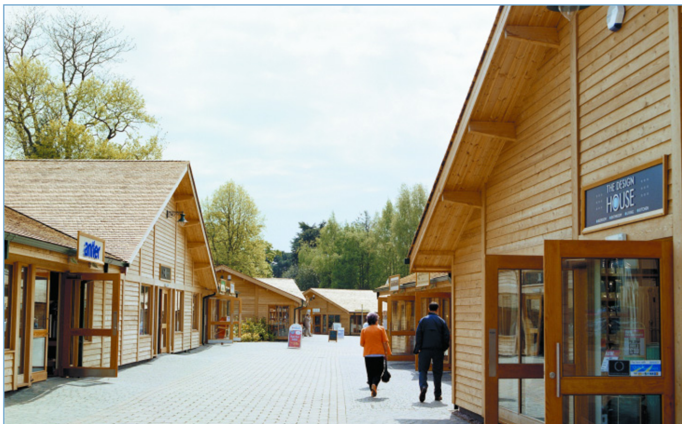
Retail units laid out in a 'village' arrangement.