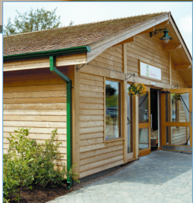
Front elevation of one of the retail units.