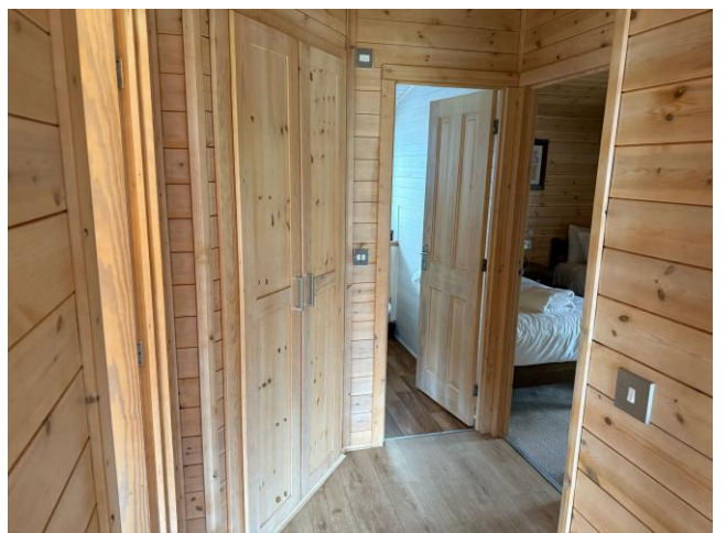
Representative photos – not actual lodge